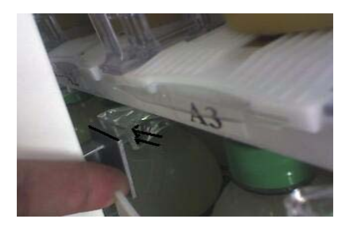
Check this adjustment at A1, B3, C5, D7, and E9. Remember Generation 1 machine the default setting is 9200 and Generation 2 machine the default setting is 2500.