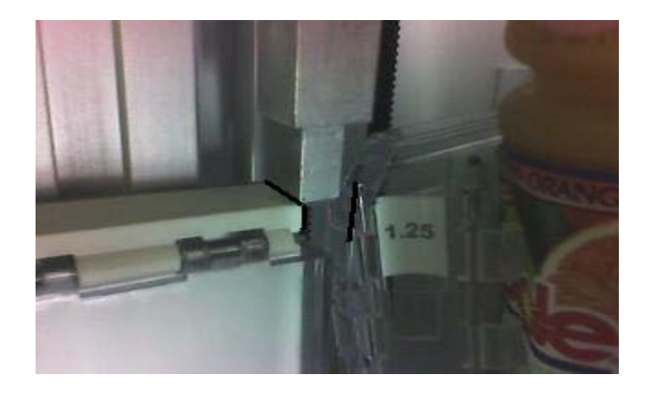
In this picture the small end of the pass / fail tool does not fit (failure) the picker cup is too close to the gate.

Using the pass / fail tool check the gap between the top of the picker cup and the top of 4 gates A1, A8, E1, and E8.