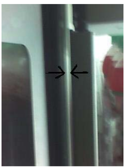
Check gaps between top of "Y" axis to the wall, and the bottom of the "Y" axis to the wall.