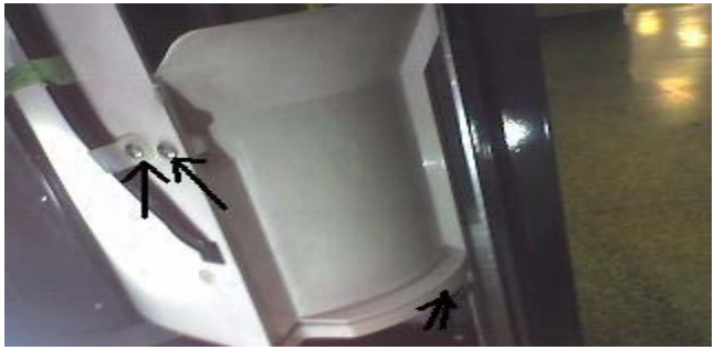
Remove side panel, Power down, unplug the vend sensor,

If the port door fails to open when a product is delivered, suspect the vend sensor, to repair: Remove the 2 screws from the back of the port door assembly,