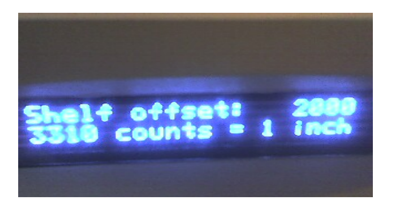
Type in a higher number to raise the picker and a lower number to drop the picker, The top of the picker should strike the target no higher than 1/16^{th} from the top ( do not hit shelf) and no lower than half way down.

Press the program button twice to enter the test mode, then press "F" for Factory Diagnostics, then "*" to enter Factory Diagnostic, then "8" for "shelf offset".