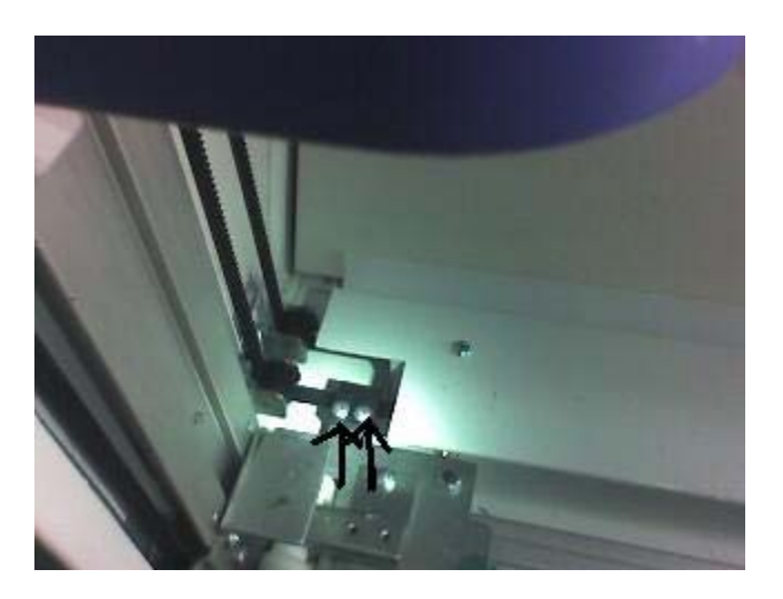
Loosen the 2 screws below the picker cup and pivot the bottom of the "Y" axis left or right until the bottom gap is the same distance from the wall as the top gap.

Check Allen head screws behind the "Y" motor if loose remove, coat threads with loctite and replace.